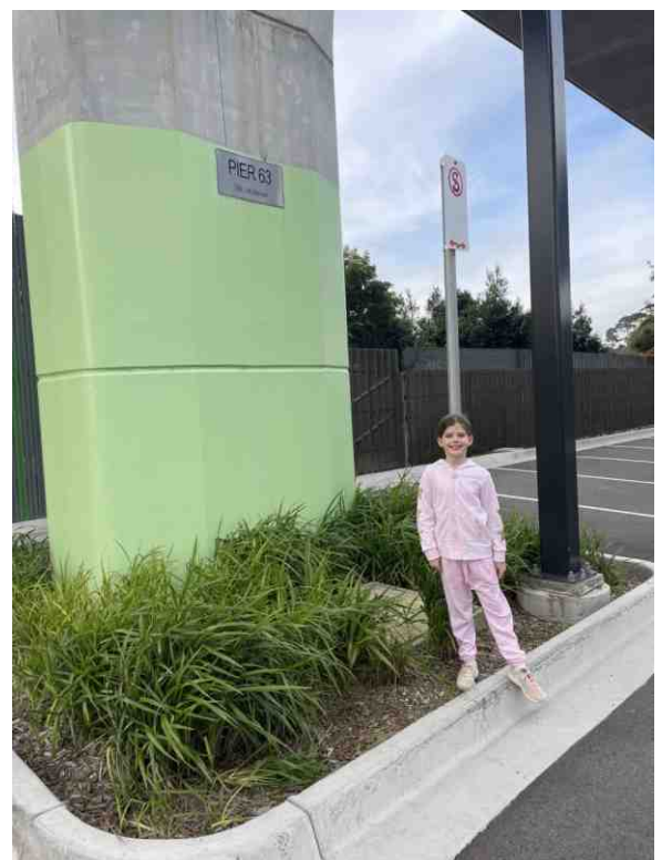
A community kid finding one of the answers to a riddle on the hunt