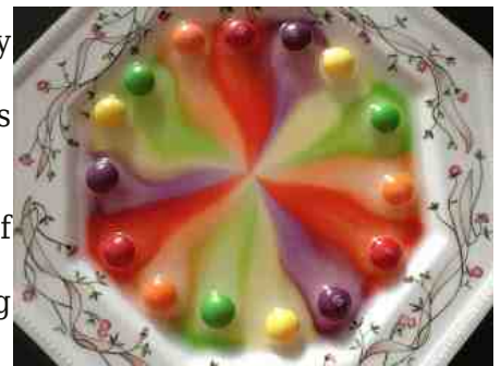
Prayer skittles from Murrumbeenes on the 11 th of July

Local Sundays; is a wonderful community initiative involving many Murrumbeena residents, it meets on the last Sunday of the month at the bowls club in Blackwood street, and provides a space for residents to gather, form community, have fun and listen to great music. I have been asked to be a part of this space and be involved with running programs and activities to the kids that attend, and also provide a bit of pastoral connection. Whilst I am yet to be involved with a real world Local Sundays, I have been excited by meeting with the team and being a part of the planning. When COVID has calmed down, I would encourage you (readers and members of MUC) to come by for a visit and see what it is all about. Here is the link to their page: https://www.facebook.com/localsundays/ we will be promoting more once we have a clear return date. In the meantime, watch this space and please hold this Ministry in your prayers.